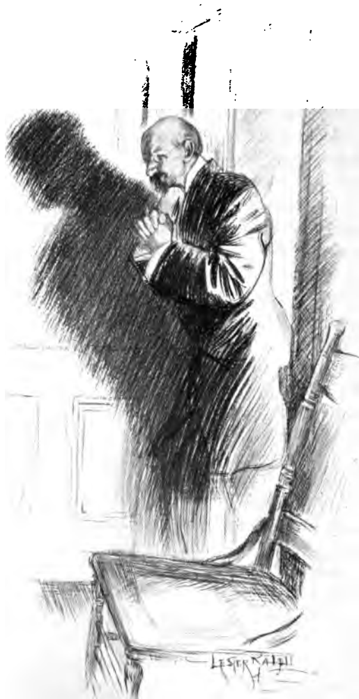
sc Doctor Masterson was prepared for his victim Page 273